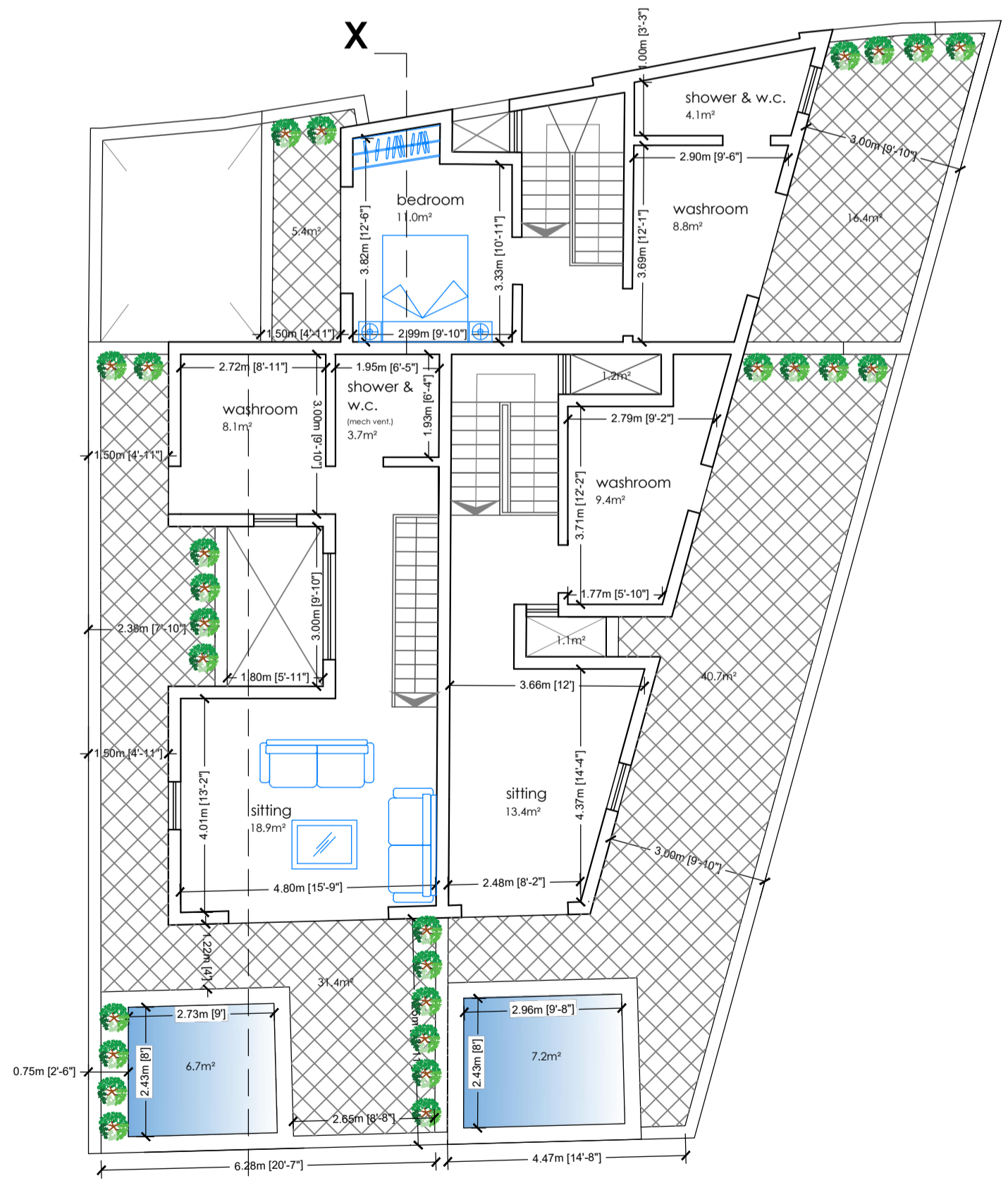
Proposed Recceded Floor Level Plan Scale 1:100