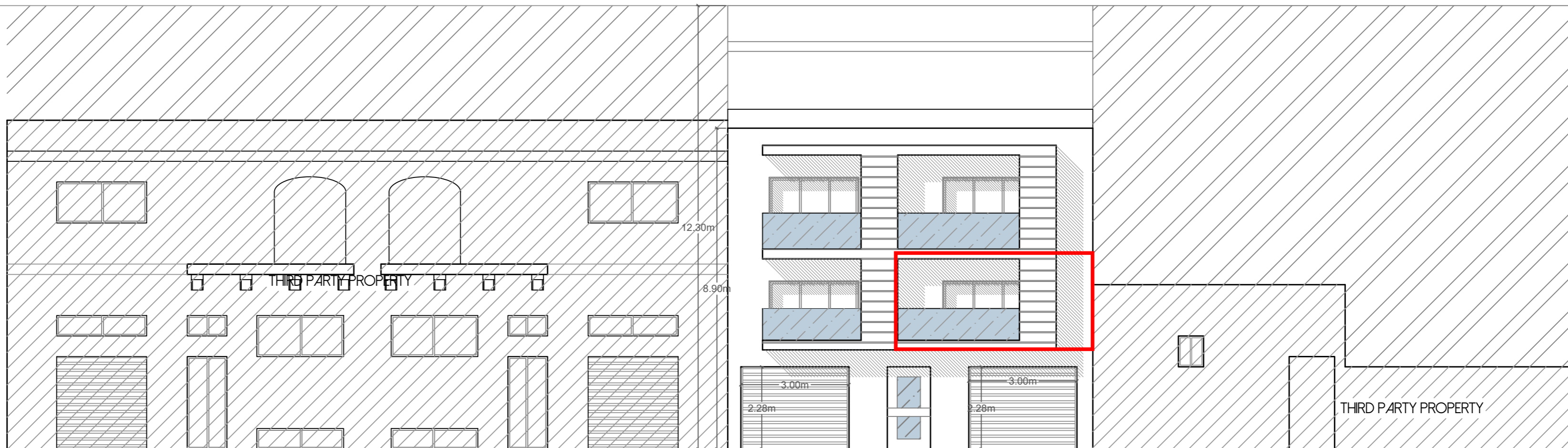
PROPOSED STREETScape ELEVATION .iso CLEAN COPY