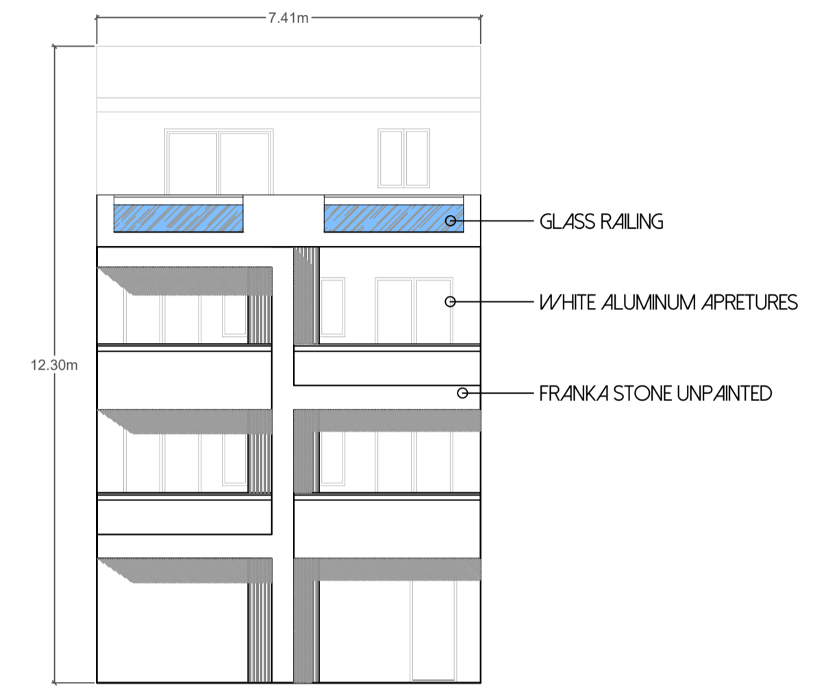
PROPOSED BACK ELEVATION SCALE 100 CLEAN COPY