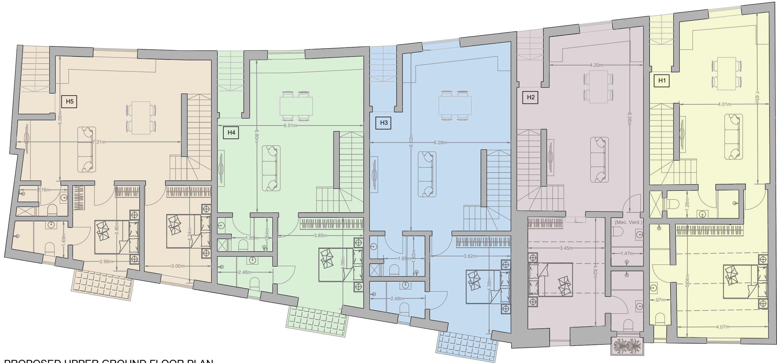
PROPOSED UPPER GROUND FLOOR PLAN SCALE 1:100