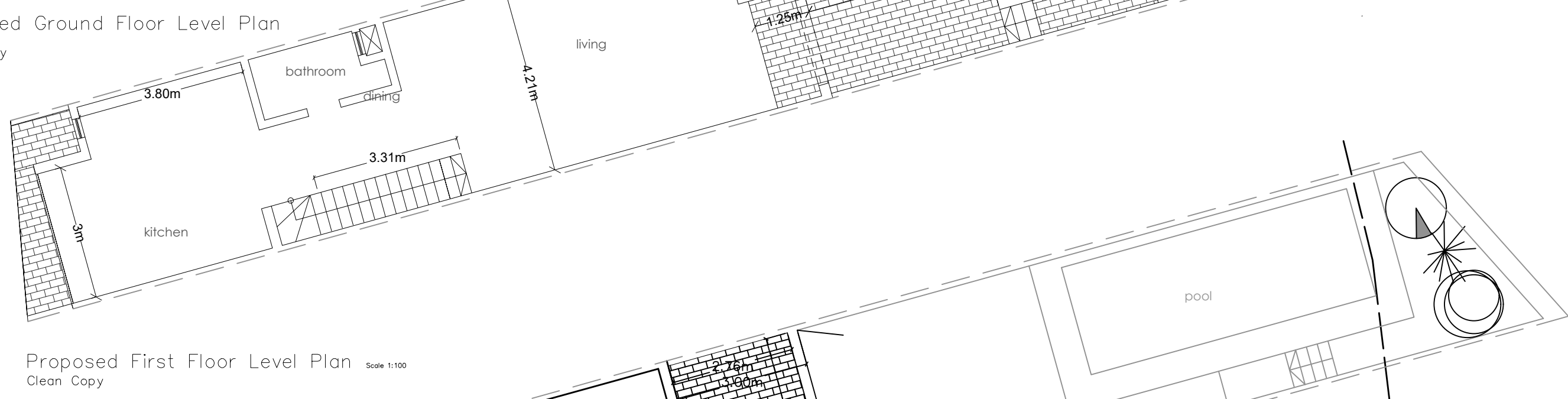
Proposed First Floor Level Plan