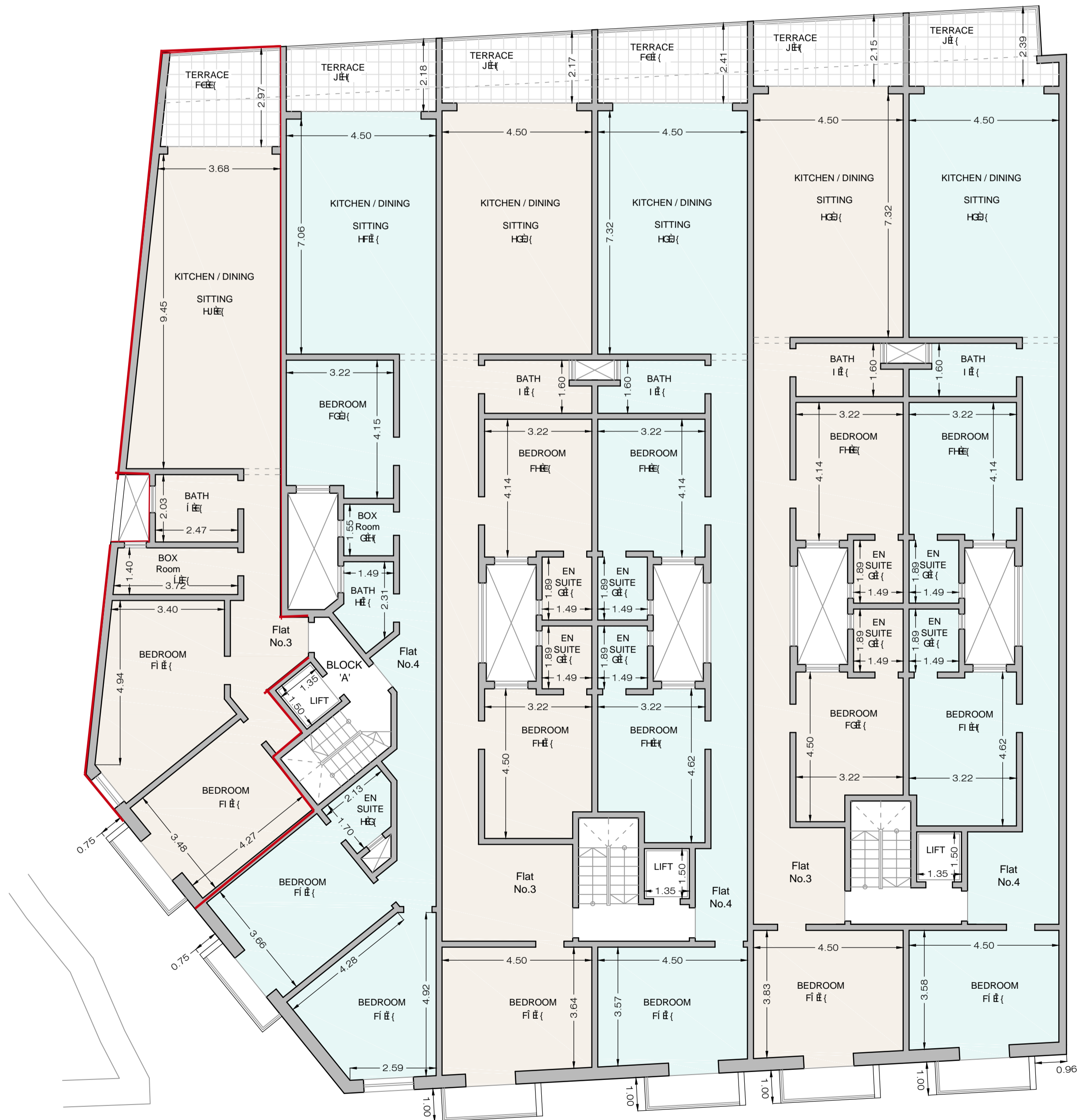
FIRST FLOOR Scale 1:100