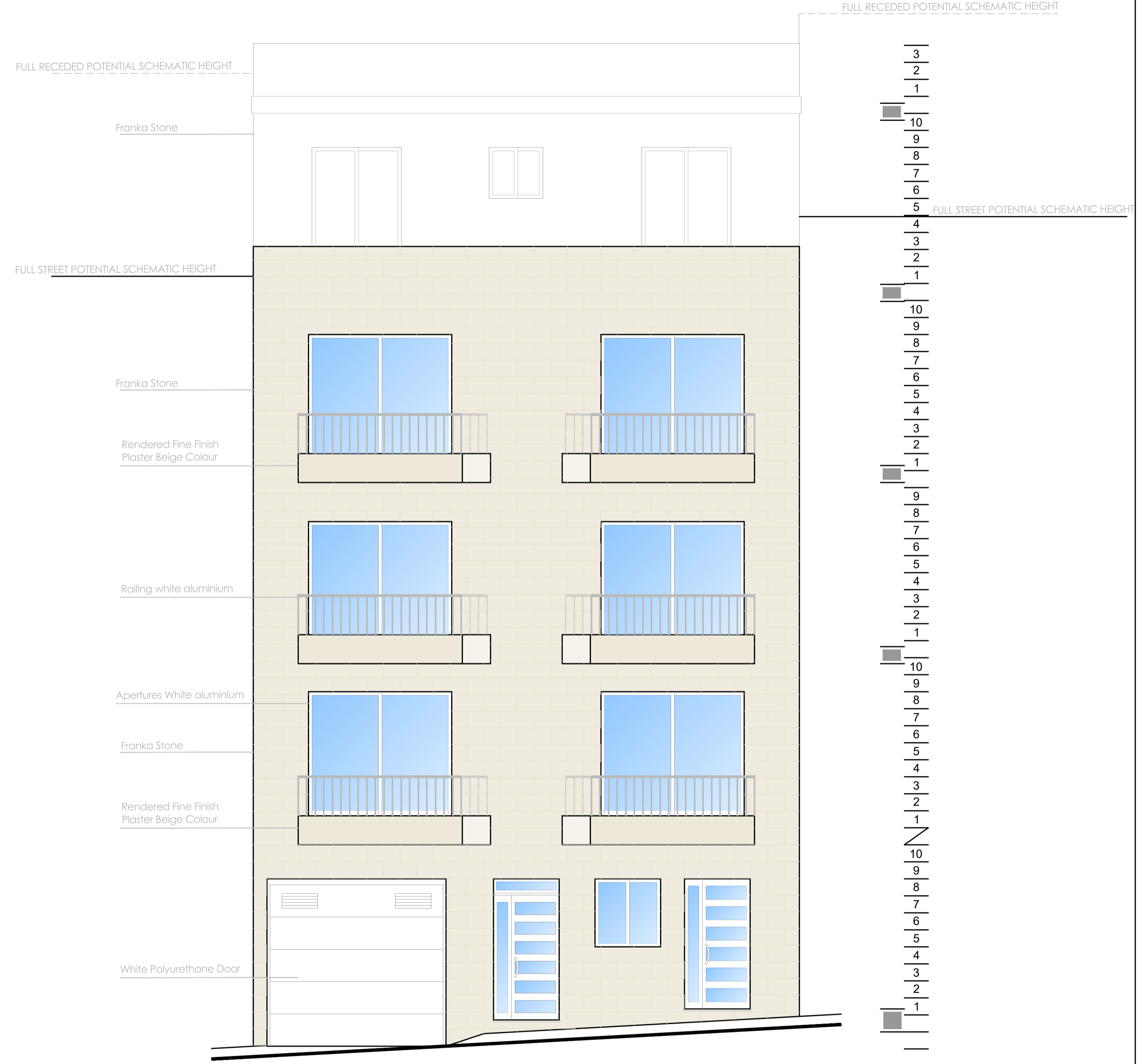
Front Elevation Scale 1:50