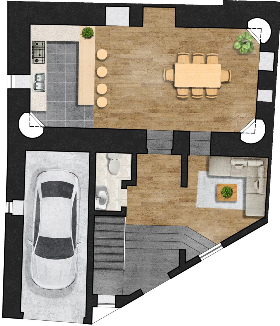
Proposed Ground floor level Scale 1:100