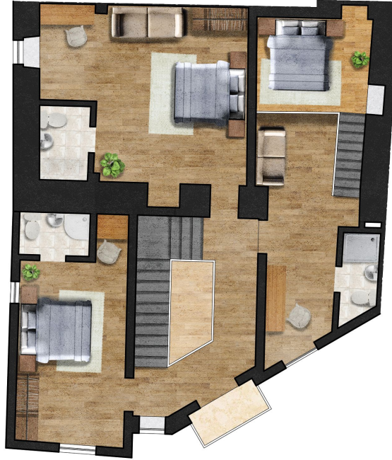
Proposed First floor level Scale 1:100