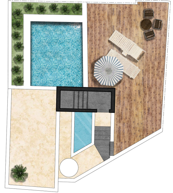
Proposed Roof Level Scale 1:100