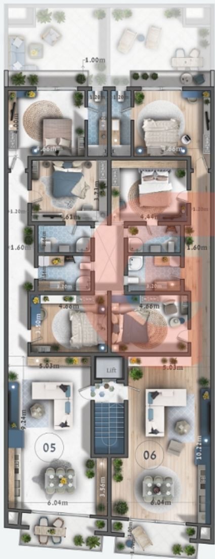
Proposed First, Second & Third Floor Plan

Apartment 03, 05, 07 Interior Area 163 m 2 Exterior Area 15 m 2 Total Area 177 m 2 Apartment 04, 06, 08 Interior Area 166 m 2 Exterior Area 15 m 2 Total Area 181 m 2