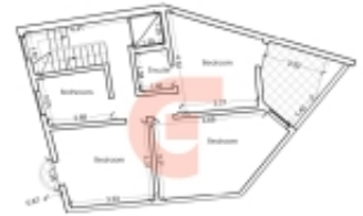
As Proposed First Floor