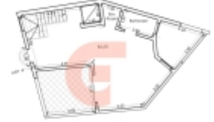
As Proposed Second Floor